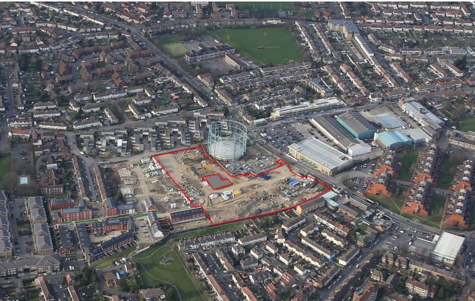
Indicative site area (Not to Scale)