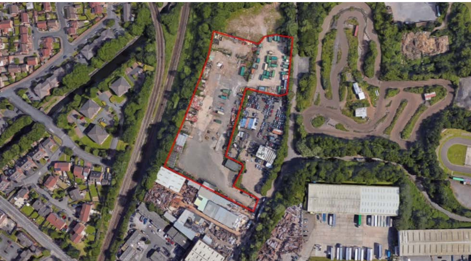
Indicative site area ( Not to Scale )