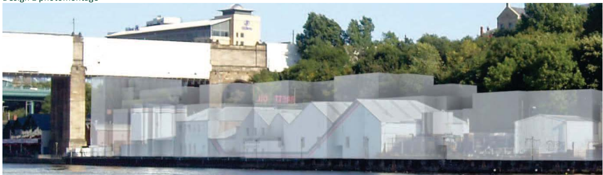
Design 2 photomontage