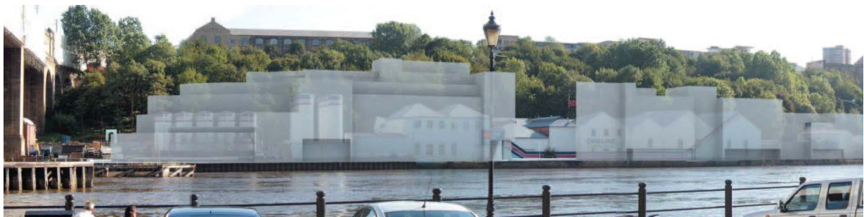
Design 1 photomontage

This prime riverside site presents one of the best opportunities in the city to bring forward a high quality mixed-use development. The agreed Development Brief indicates it is possible to develop a mixed-use scheme totalling in the region of 140,000 sq ft of gross development area. Uses considered acceptable by the newly adopted Core Strategy and Urban Core Plan for Gateshead and Newcastle 2010 - 2030 include residential, leisure, hotel and office.