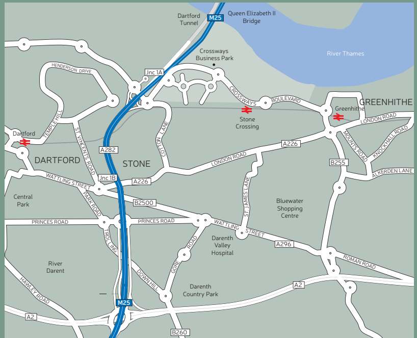
INDICATIVE BUILDING POSITION

Crossways Point also benefits from a wide range of facilities and amenities on site or in the near vicinity.