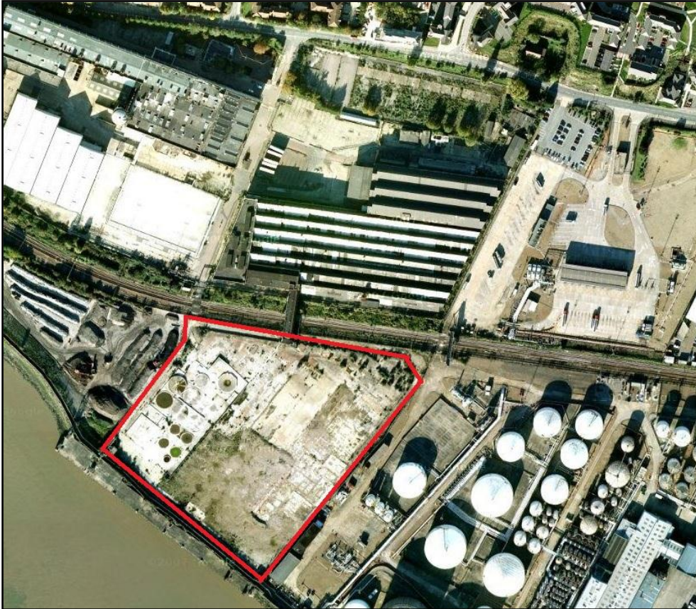
Map for guidance purposes only.